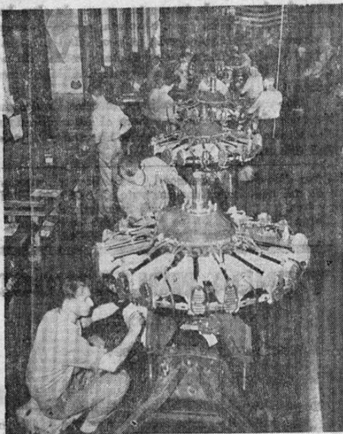
La eficacia y eficiencia de los aparatos norteamericanos que están bombardeando sin cesar las instalaciones y centros industriales alemanes, han llamado la atención sobre las excelencias del material y el alto grado de eficiencia de la industria de los Estados Unidos. Particularmente los motores, como puede verse en la fotografía, son minuciosamente examinados y experimentados repetidas veces antes de ser instalados en los aviones.